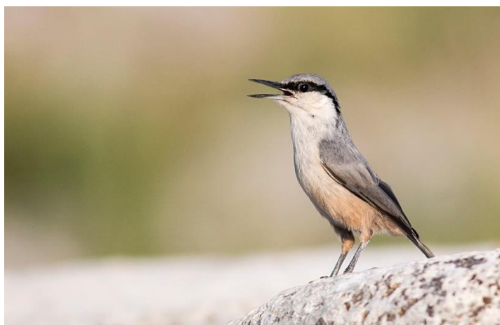
Western Rock Nuthatch

This morning we'll explore locally and visit a dramatic cliff-bound valley not far from Gjirokastër. An exciting cast of birds that we are likely to encounter here include , Sombre Tit, Black-eared Wheatear, Blue Rock Thrush and Cirl Bunting. There's a good chance of migrants such as Collared Flycatcher, Common Redstart and Subalpine Warblers and we must keep an eye on the cliffs and skylines as Short-toed Eagle, Peregrine and Egyptian Vulture all occur regularly. Even the ultra-elusive Rock Partridge is a possibility.