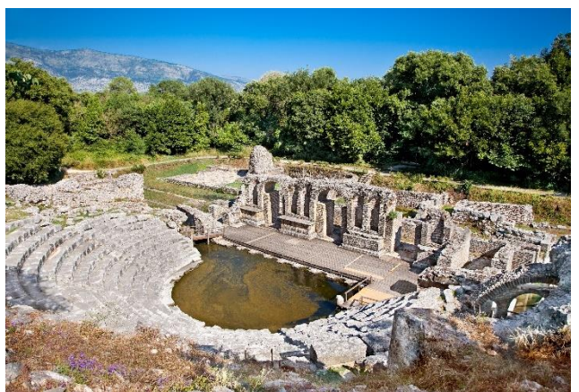
Dalmatian Pelican, Lesser Kestrel, Butrint Amphitheatre