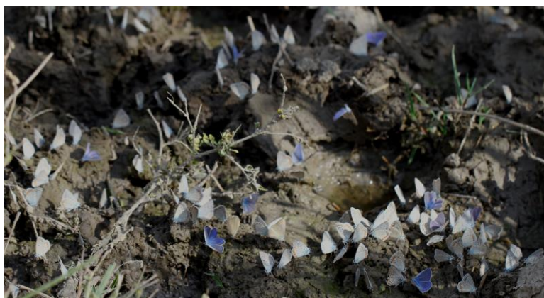
Blues mud puddling (Tom Brereton)

On leaving Mount Aragats we will drive for about an hour to Yerevan to make a further stay in a city hotel.