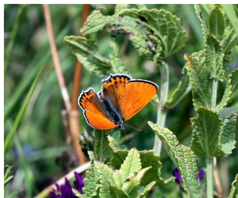
Images from top: Gavarnie Blue, Meleager's Blue, Lycaena kurdistanica (Tom Brereton)