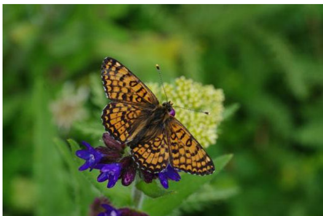
Heath Fritillary

The mountain pass near Janjour and Gyumri