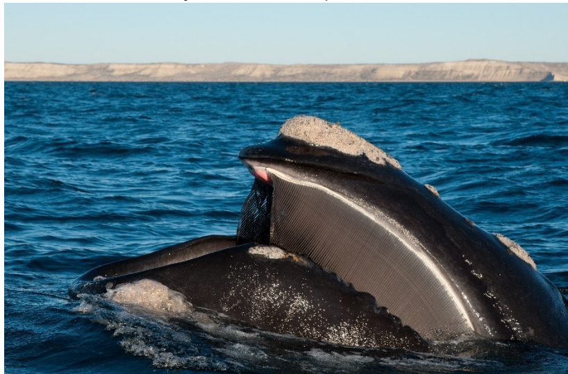
Southern Right Whale

Just offshore, there's a chance of spotting Humpback and Southern Right Whales, often visible from the coastline during their southbound migration.