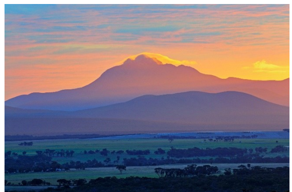
Elegant Parrots, Humpback Whale, Stirling Range