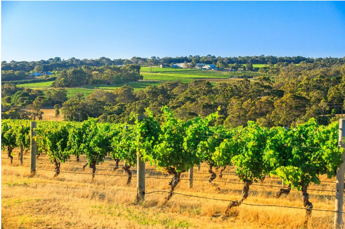
Margaret River wine region

Later in the morning, we turn our attention to the celebrated Margaret River wine region. Though relatively young by global standards, Margaret River has rapidly earned a reputation as one of the world's great fine wine regions. With its Mediterranean climate, cooling maritime influence, and ancient gravel-loam soils, the area is ideally suited to varieties such as Cabernet Sauvignon and Chardonnay - both of which now rank among Australia's most acclaimed.