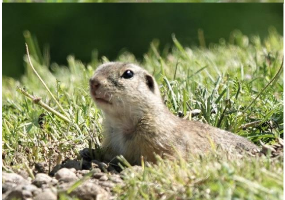
From top: Red-footed Falcon, Military Orchid, European Suslik