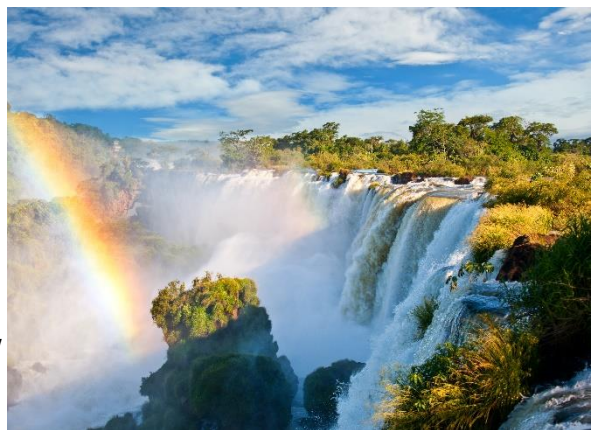
Jaguar, Toco Toucan, Iguazú Falls