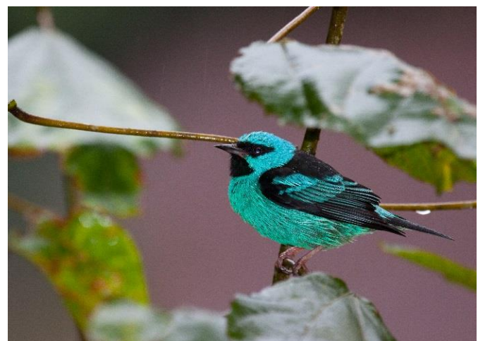
Green-headed Tanager, Violaceous Euphonia, Blue Dacnis