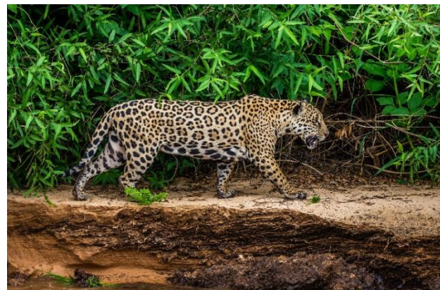
Harpy Eagle, Toco Toucan, Jaguar