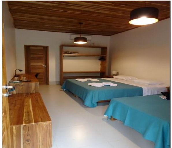
Room at SouthWild Amazon Lodge

Our three lodges in the Pantanal offer clean and comfortable rooms, all with air conditioning and en-suite bathrooms.