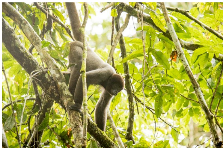
Gray Woolly Monkey

With the flexible itinerary we will attempt to find the special and endangered primates in the area and try to photograph them. Gray Woolly Monkey ( Lagothrix cana ) and the White-nosed Saki ( Chiropotes albinasus ) are two of the star species here. These two species, both sadly listed as endangered by the IUCN, are endemic to the central-southern Amazon. Thankfully their population is healthy here and the guides keep