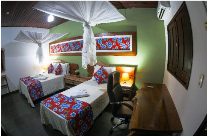
SouthWild Pantanal Lodge Room

Flotel Naturezas is an 85-foot, purpose-built vessel with 7 rooms for our group. Each room is well equipped and air conditioned. As with the Jaguar Flotel there is an observation deck for viewing the surroundings and a spacious dining area.