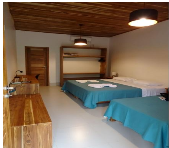
Room at SouthWild Amazon Lodge

The lodges in the Pantanal offer clean and comfortable rooms, all with air conditioning and en-suite bathrooms.