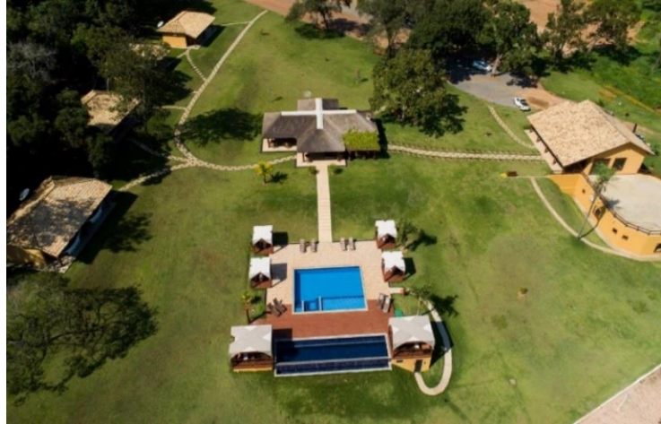
View over Pousada Boyrá

Leaving this special place behind, we will make a 45-minute drive to our next accommodation, Pousada Boyrá. This fantastic riverside lodge is located close to the banks of the Rio Formoso and near the meeting point with the Cristalino River. A small boutique eco-lodge, we are again surrounded by excellent habitat and close to the main areas we wish to explore. We will settle into our lovely rooms and may have time for a swim in the pool here or acquaint ourselves with the extensive grounds and abundant wildlife before dinner.