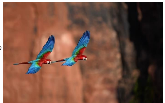
Jaguar, Rio da Prata Snorkel, Red-and-green Macaws