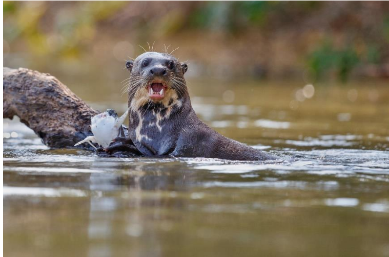
Giant River Otter

Grade A/B. This is a conventional wildlife-viewing tour. The tour consists of day walks only, alongside vehicular and boat safaris, and is suitable for those of all ages and degrees of fitness. The weather is likely to be hot and the heat may make it more physically demanding but there are no long walks planned. One of the main objectives will be to provide participants with observations of Jaguar in the wild as well as Giant Anteater, Giant Otter and a range