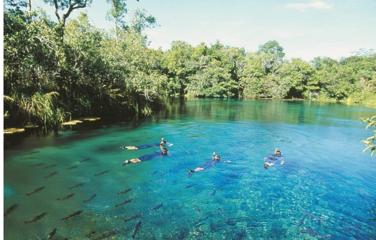
Relaxing Rio da Prata Snorkel

Once arrived, we will stop for lunch before making our way to the Recanto Ecológico Rio da Prata – a private nature reserve around 50 kilometres from Bonito's town centre. Here, we will be greeted by our local guides, who will brief us and provide us with the appropriate gear for a snorkel in the nearby Rio da Prata. This will be a wetsuit, mask, snorkel, boots and life vest. These rivers are world famous for their