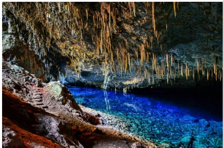
Gruta do Lago

After breakfast, we will make the 1-hour drive to the wonderful Gruta do Lago Azul (the Blue Lake Cave). This otherworldly limestone cave has been naturally carved out over thousands of years. The adventure begins with a 300-metre trail through native forest and along the way, we may enjoy a number of birds, butterflies, and sometimes small mammals. A steep stairway then descends for around 200 steps into the cool darkness, with our only light being that of our guide's torch. Then, suddenly, you see it, the brilliant blue lake that gives the cave its name. When sunlight enters through the cave's opening, usually between 8:00 and 10:00am, the rays hit the water at the perfect angle, making it glow in an intense, surreal shade of sapphire blue. Scientists believe this is due to a combination of the mineral content in the water and the way sunlight refracts inside the cave. The lake is incredibly deep, over 80 metres, according to divers, and contains ancient fossils of prehistoric animals,