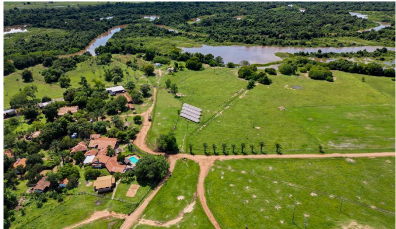
View over Pousada Aguapé

We will now have two full days to search for wildlife from this fantastic lodge and a mouthwatering array of species are possible here. Before breakfast, optional early morning excursions around the lodge grounds offer the chance to see some of the abundant birdlife.