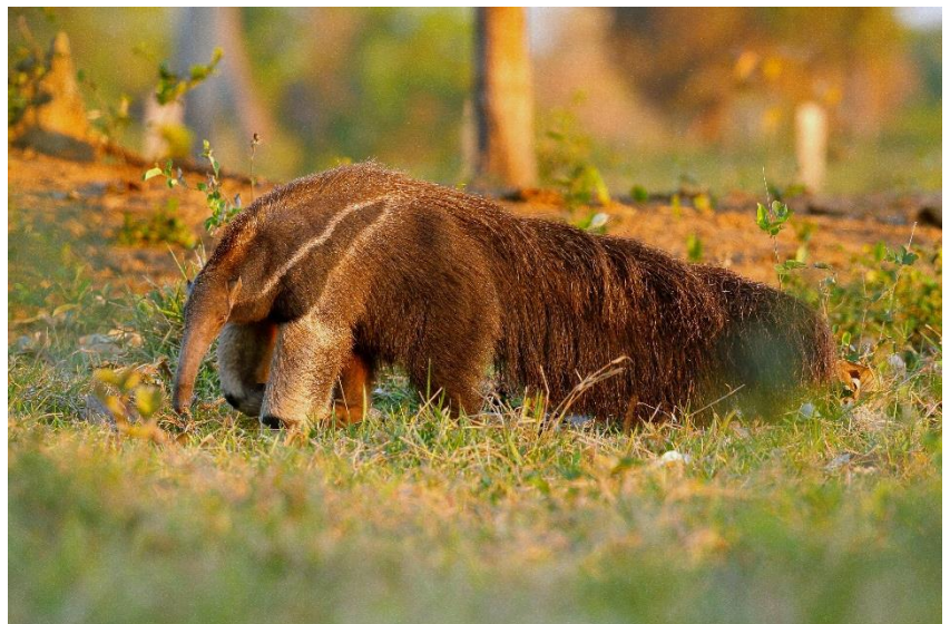
Giant Anteater ( Myrmecophaga tridactyla )

The lodge lies off the Transpantaniera road and we will be passing the end of the driveway as we travel to the airport. After passing along the 3km driveway we will settle into the lodge. We will enjoy some birding around the lodge with a wealth of species to enjoy, making an effort to find the White-fronted Woodpecker ( Melanerpes cactorum ), a species not easily found at other locations along the Transpantaneira. In the late afternoon we will head out to try and find Giant Anteater.