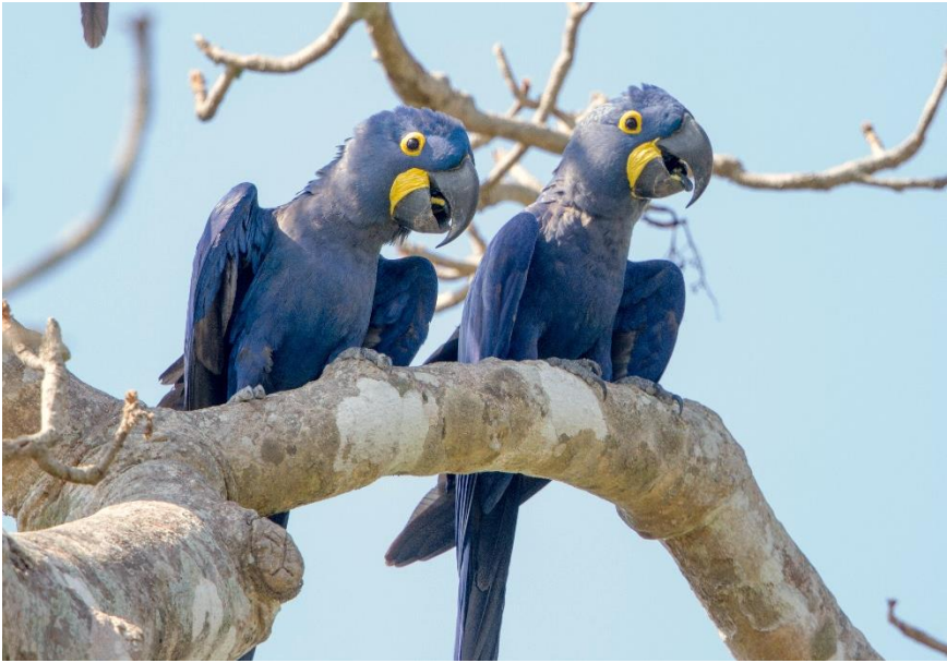
Giant Anteater ( Myrmecophaga tridactyla )

We will head out very early, before breakfast to try to find Giant Anteater in the surrounding habitat before returning to the lodge for breakfast. After refueling at breakfast we will continue to enjoy the lodge grounds with some light birding and searching for wildlife. Beautiful Hyacinth Macaws are resident here and breed