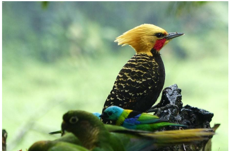
Bonde-crested Woodpecker, Green-headed Tanager and Maroon-bellied Parakeet

As well as our time spent birding around the grounds of Espinheiro Negro, as you will have a private guide and vehicle, you may also travel for a day trip to the superb Trilha Dos Tucanos Lodge if you wish. This lodge is around two hours away and is again a special place for birding. The feeding station next to the lodge dining area regularly has Saffron Toucanet visiting along with Red-breasted Toucan with Plain and Maroon-bellied Parakeets in abundance with a host of tanagers and striking woodpeckers including Blond-crested and Yellow-fronted. A hummingbird garden often holds multiple species including Sapphire-spangled Emerald and Brazilian Ruby and trails can be walked to explore the habitat. Some species are easier to see here than at Espinheiro Negro and vice versa. Use of your time will be maximised to achieve the best possible sightings.