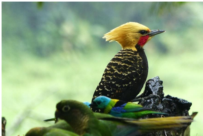
Bonde-crested Woodpecker, Green-headed Tanager and Maroon-bellied Parakeet

As well as our time spent birding around the grounds of Espinheiro Negro, as you will have a private guide and vehicle, you may also travel for a day trip to the superb Trilha Dos Tucanos Lodge if you wish. This lodge is around two hours away and is again a special place for birding. The feeding station next to the lodge dining area regularly has Saffron Toucanet visiting along with Red-breasted Toucan with Plain and Maroon-bellied Parakeets in abundance with a host of tanagers and striking woodpeckers including Blond-crested and Yellow-fronted. A hummingbird garden often holds multiple species including Sapphire-spangled Emerald and Brazilian Ruby and trails can be walked to explore the habitat. Some species are easier to see here than at Espinheiro Negro and vice versa. Use of your time will be maximised to achieve the best possible sightings.