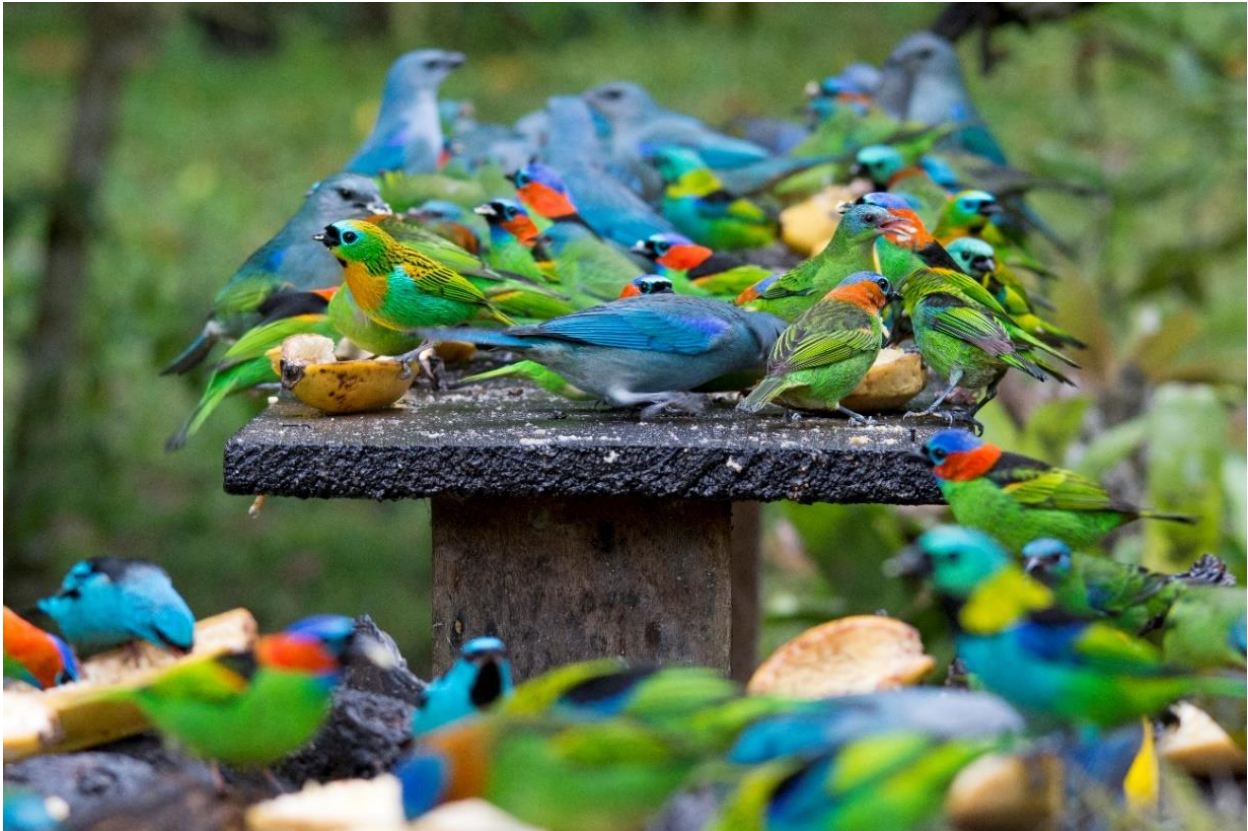
Espinheiro Negro Lodge Feeding station