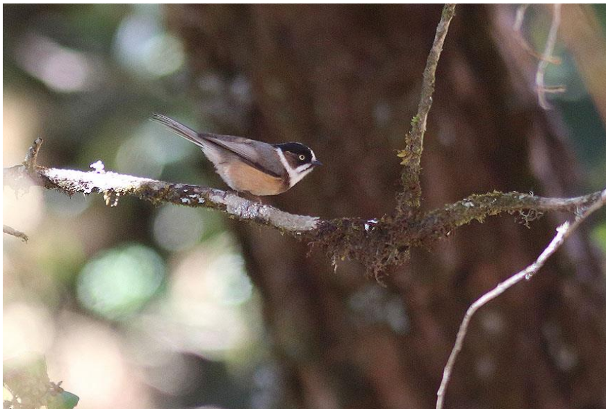
Burmese bush tit

Burma, now officially called Myanmar, is the second largest country in south-east Asia, covering over 670,000 square kilometres and stretching some 2,000 kilometres from the cold, lofty heights of the Himalaya in the north to the humid tropical lowland forests that fringe the Bay of Bengal in the south. With a current list of over 1,060 bird species, Burma is also a wonderfully rewarding country for anyone keen to enjoy its birdlife, not least because there is so much excitement to be experienced in exploring a country whose avifauna is still relatively little-known, access to visiting naturalists having been impractical for a generation or more during the decades of military government. Fortunately, due to recent political reforms, life for Burma's 45 million people is changing and visitors are welcome, the country's thousands of beautiful pagodas and extensive tracts of wildlife-rich forest providing attractions of great potential.