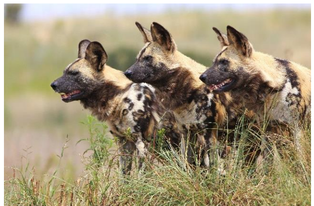
Images from the top: Lions, Elephant, Wild Dog