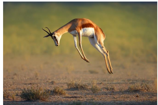
From top: Kalahari Lion, Crimson-breasted Shrike & Springbok