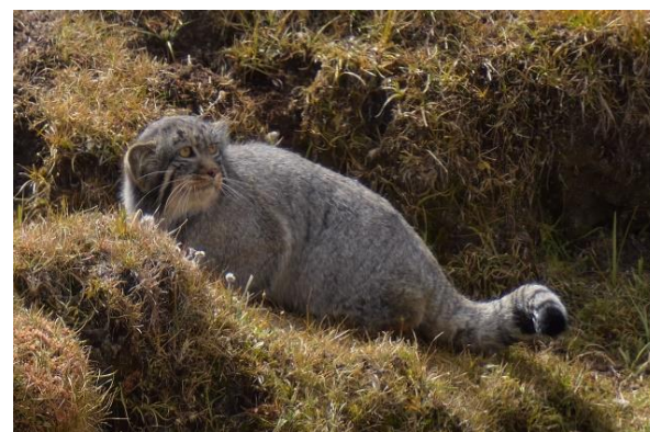
From the top: Red Pandas, White-browed Tit-Warbler & Pallas' Cat.