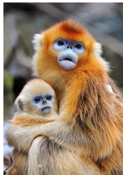
From the top: Jiuzhaigou National Park, Blue Eared-pheasant & Golden Snub-nosed Monkeys