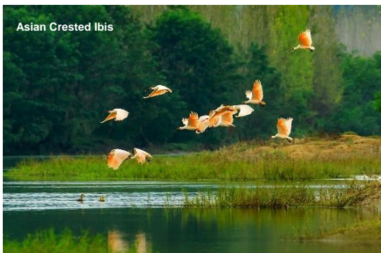
Asian Crested Ibis

Today we have a long drive of around eight hours out of the province of Shaanxi and into neighbouring Sichuan. Our ultimate destination is Tangjiahe Nature Reserve, but before we reach the provincial border we will stop at Yangxian to look for the Asian Crested Ibis. This is one of the rarest birds in the world, but one that has made a remarkable recovery from a low of just seven birds in the early 1980s to the current population of around 500 individuals. As well as looking for the ibis we will keep our eyes open for a variety of other species such as White-breasted Waterhen, Chinese Sparrowhawk, Collared Finchbill, Red-billed Starling and Vinous-throated Parrotbill.