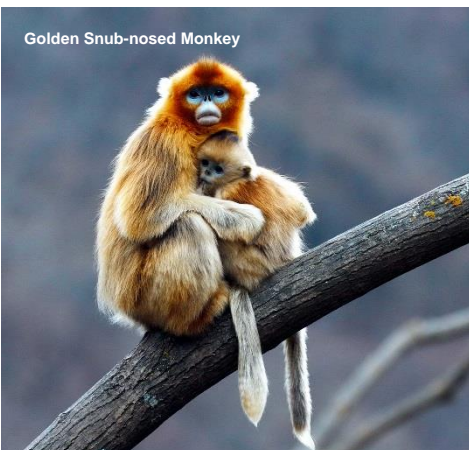
Golden Snub-nosed Monkey

The town of Foping shares its name with the world-famous Foping National Nature Reserve which focuses on the conservation and protection of Giant Pandas. The main part of the reserve – in which the wild pandas roam – has been closed to the public for nearly a decade, but we can still visit a park on its edge called 'Panda Valley'. Although the only Giant Pandas to be seen here will be in an enclosure, we will be able to enjoy close views of a troop of habituated, but totally wild, Golden Snub-nosed Monkeys. This endangered and striking-looking primate, with its strange nose, blue lips and golden shaggy pelt, is endemic to central China. They inhabit temperate mountain forests between 1,500 to 3,400 metres in altitude, and in most of their very