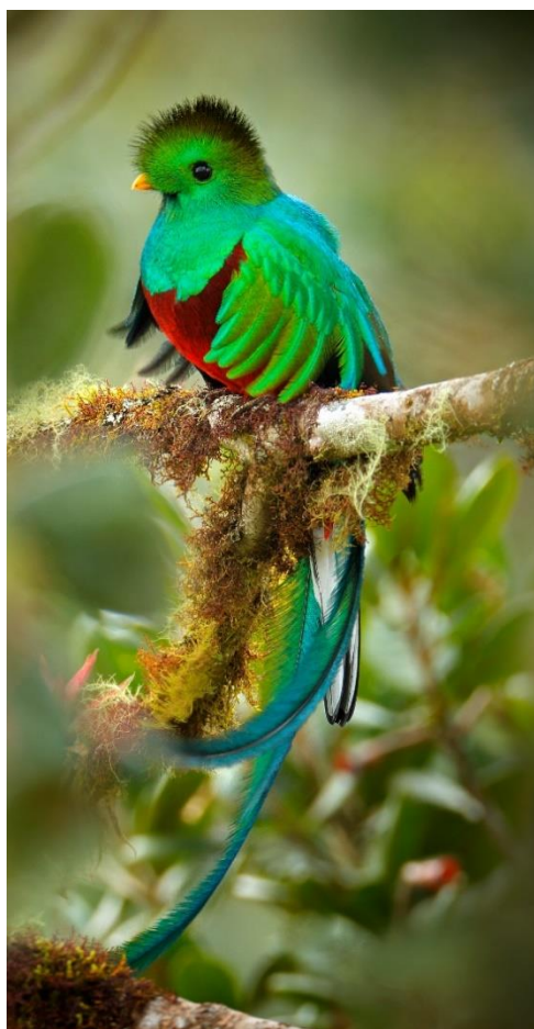
Keel-billed Toucan & Resplendent Quetzal.