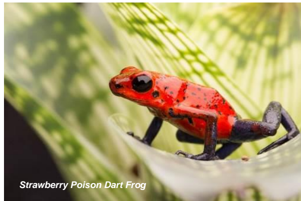
Strawberry Poison Dart Frog

We will be spending a full day (returning to Selva Verde for lunch) at the well-known La Selva Biological Station run by the Organisation for Tropical Studies (OTS). La Selva was acquired by the OTS in 1960 and is today principally used for biological research, education and studies into the sustainable use of tropical forests. There is a good network of trails which meander through the 1,500-hectare reserve providing an excellent opportunity to observe birds in a range of habitats. Besides primary lowland tropical forest, there are areas of swamp, pasture, agricultural land, rivers and creeks and secondary forests in various stages of development. Over 400 species of birds, 100 species of mammals, and 2,000 species of plant have been recorded at La Selva; with such great diversity we have a very good chance of amassing an impressive selection of birds, many of which we will not have seen previously.