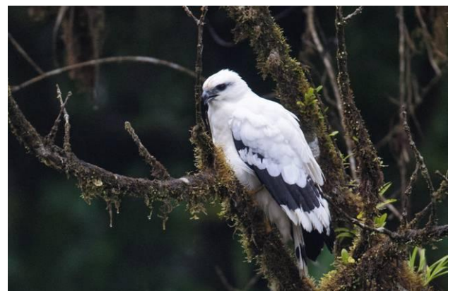
Images from top: Corcovado National Park, Baird's Tapir & White Hawk.