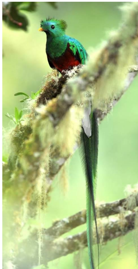
Keel-billed Toucan & Resplendent Quetzal.