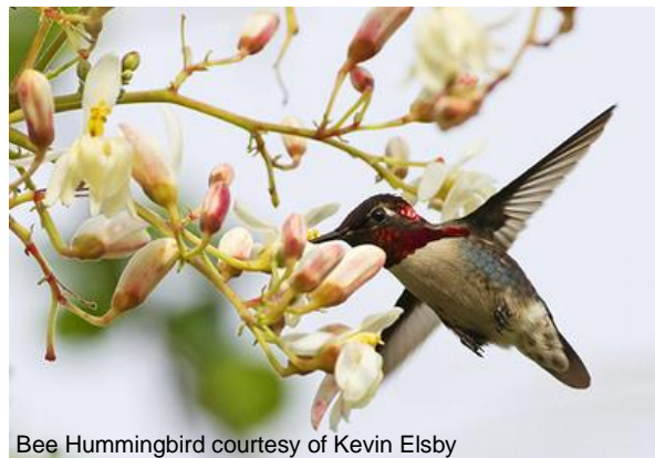
Bee Hummingbird