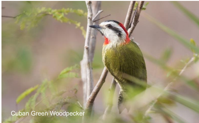
Cuban Green Woodpecker

Driving south from Camagüey to the environs of the small village of Najasa, we spend much of today looking for some of the unique birds which live in the Sierra de Chorillos, a small mountain ridge across the Najasa Mountains. Endemics will be to the fore as we search for the very rare Giant