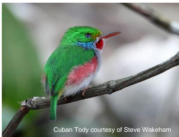
Cuban Tody