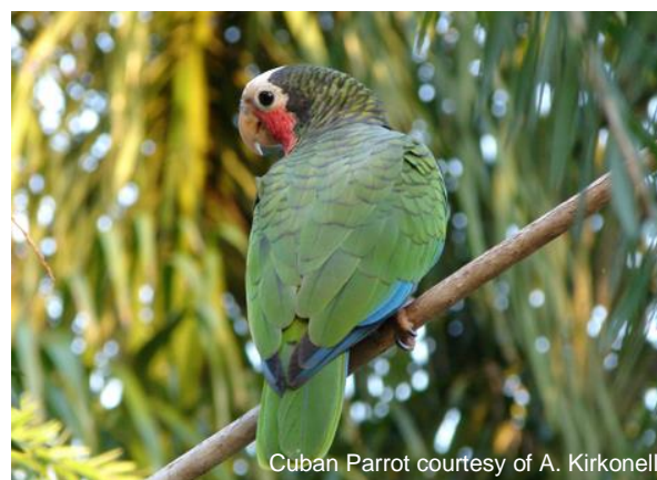
Cuban Parrot