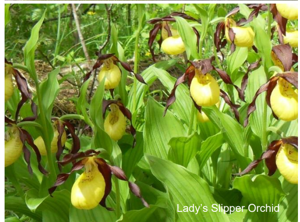
Lady's Slipper Orchid