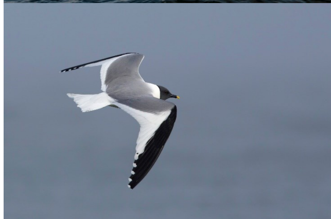
Red-breasted Flycatcher, Heligoland, Sabine's Gull