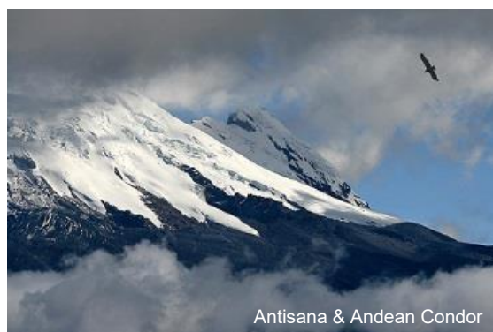
Antisana & Andean Condor

While scanning the high, windswept páramo for a bear or a tapir is our priority here, birds will never be too far away. While searching for mammals we may also be able to point out Andean Condor, Carunculated Caracara, Andean Gull, Black-tailed Trainbearer, Scrub and Blue-and-yellow Tanagers and Southern Yellow-grosbeak. On clear days the scenery is spectacular (photographers will be particularly happy), with superb views of the snow-capped Volcán Antisana. This area, known as the Papallacta Pass by birders, is rich in páramo birdlife, and with decent weather, we can expect to see some of the following: Rufous-bellied Seedsnipe, Ecuadorian Hillstar, Tawny Antpitta, Many-striped Canastero, White-chinned Thistletail, Red-rumped Bush-tyrant, Black-billed Shrike-tyrant and Brown-backed Chat-tyrant.