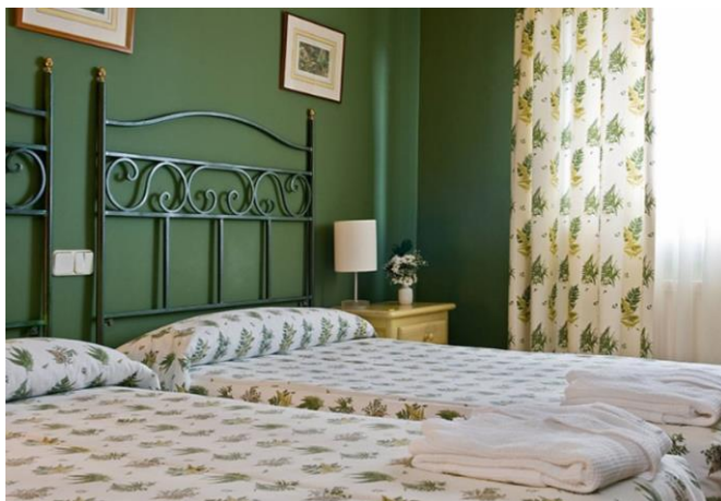
Our hotels in Extremadura (left) and the Gredos Mountains (right)