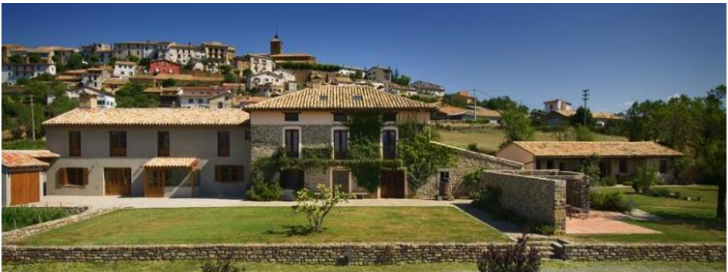
Our picturesque accommodation in Berdun