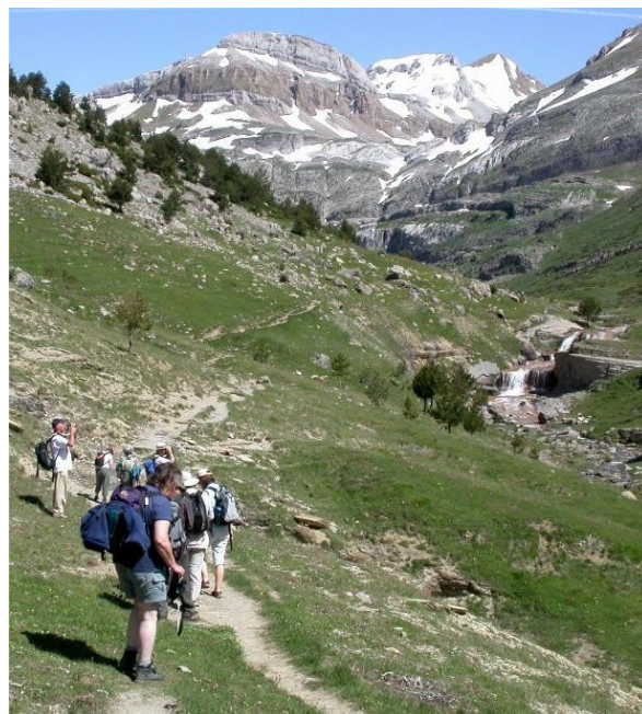
Naturetrek group walking in the Spanish Pyrenees

From our outstanding base in Berdun we will explore both the foothills and mountains of the Spanish Pyrenees on daily outings, enjoying their natural history by means of gentle day walks. Our pace will be slow, as we look for birds, plants and butterflies, but we shall aim to be outdoors as much as possible covering perhaps between 4 to 5 miles each day. This holiday should suit those of all ages who enjoy natural history and mountain environments. Walks will of course vary in severity with some steeper than others but we will move at a gentle pace with regular stops of course, as we aim to see the areas superb flora and fauna.