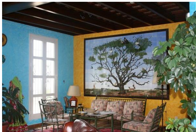
Some of the accommodation (left) and the living room area (right) of our hotel in El Rocio