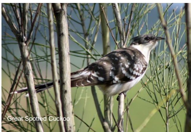
Great Spotted Cuckoo

After settling in we should have time before dinner to enjoy some of the star birds around the grounds and to whet our appetites for tomorrow's activities.