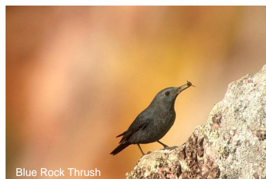
Blue Rock Thrush

We will also have a look at the high rocky cliffs of Sierra de la Plata. Here, amongst the eerie screeching of the resident Griffon Vulture colony, mountain specialities such as Blue Rock Thrush, Crag Martin, and Rock Bunting are all likely to be encountered. We should again find ourselves in the midst of the Autumn raptor migration, and will take our final chance to sit back and relax with a picnic and a glass of wine as the spectacular birds drift overhead.