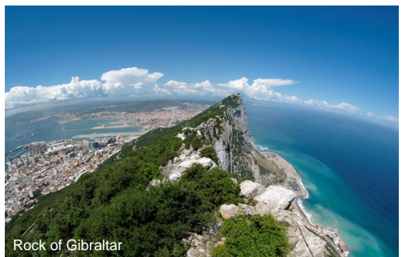
Rock of Gibraltar