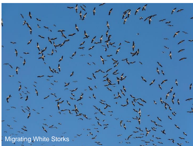
Migrating White Storks

We begin with a flight to Gibraltar, from where we transfer the short distance to Cortijo el Indiviso, our delightful rural farmhouse accommodation near Vejer de la Frontera.