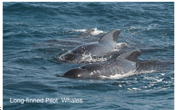
Long-finned Pilot Whales