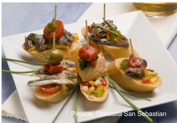
Pintxos, Donostia San Sebastian

San Sebastian has more Michelin stars per capita than anywhere else in the world, and epitomizes the culinary extremes of Spain’s dining spectrum; from upmarket three Michelin star restaurants to the humbler ‘holes-in-the-wall’ you may simply wish to explore the gastronomic wonders of San Sebastian with a pintxos bar-crawl in the old town.