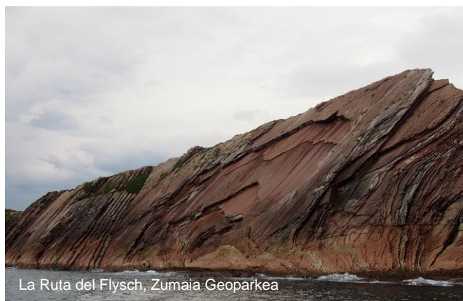
La Ruta del Flysch, Zumaia Geoparkea

Today we return to the Basque coast to visit yet another spectacular UNESCO heritage site – the Zumaia Geopark. En route, we'll visit the historical little town of Lastur, with its famous Plaza de Toros and watermill.