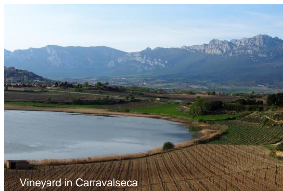
Vineyard in Carravalseca

This three-centred, 9-day tour brings together culture and gentle birding: here is a place that differentiates itself markedly from neighbouring France and the rest of northern Spain, with its rugged coastline and coastal paths, craggy mountains and lush, verdant valleys with their complementary wildlife, and a proud history incorporating a long fight for independence and autonomy, an ancient autochthonous language, and long established historical pilgrimage routes. In addition, here are five UNESCO world heritage sites. The Basque Country is indeed one of the jewels of Iberia.