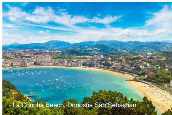
La Concha Beach, Donostia San Sebastian

We will visit the Bay of Txingudi this morning, the most iconic salt marshes of the Gipuzkoa Province. We will then travel to San Sebastian. Otherwise known as Donostia in the Basque language, is located on the eastern coastline of the Bay of Biscay and is famous for the stunning, shell-shaped La Concha Beach (amongst many other landmarks). Often referred to as the most beautiful city beach in Europe you might want to take a refreshing dip along the spacious 1,350-meter-long bay of clear blue Atlantic waters or go for a long walk to the “ Pico de Loro ” (the parrot’s beak); a small passage of rocks which disappears during high tide and marks the end of La Concha Bay.