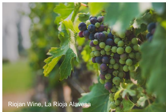
Riojan Wine, La Rioja Alavesa

We will enjoy some gentle birding around the three endorheic (no external drainage) lakes in amongst the vineyards of Carravalseca. Here we look for Purple Heron, larks, Western Orphean Warbler, Bearded Tit, Great Reed Warbler, and Night Heron, Golden Oriole and the colorful acrobatics of European Bee-eaters. There will also be a tour inside the subterranean Casa