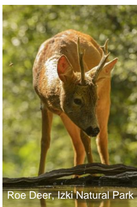
Roe Deer, Izki Natural Park

There are six species of woodpecker in Izki Natural Park, including the Middle-spotted, Greater, Lesser-Spotted and Black Woodpecker. Although we're too late in the year for the best woodpecker conditions (which can be found in February and March, when the trees are still bereft of leaves, and the birds are setting up territories), we will be listening for the tell-tale sounds of these charismatic birds as we traverse the extensive woodlands of the Basque region of Alava.