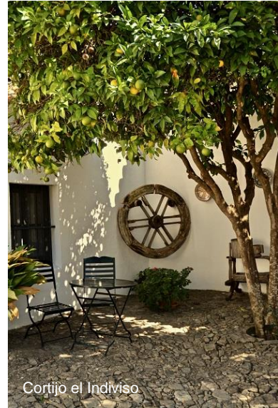
Cortijo el Indiviso

After a welcoming lunch or afternoon tea, we'll take the afternoon to settle in to our lodgings and explore our local woodland surroundings on a leisurely stroll. We may even be lucky enough to get a visit from some of the local Northern Bald Ibis! This Critically Endangered bird breeds nearby since its successful reintroduction and often drops in to feed on the insect-rich pastures of the cortijo .