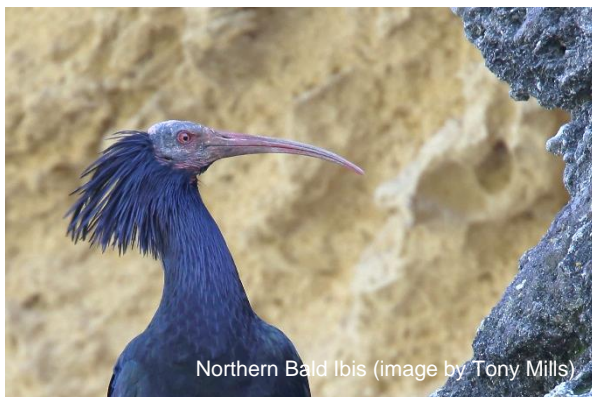
Northern Bald Ibis

Today, alongside more raptor-watching at sites with stunning views across the Straits to North Africa, we'll make a visit to nearby Barbate salt pans. This area is home to Kentish Plover and Pied Avocet and offers a fantastic selection of waders which change every day such as Little Stint, Curlew Sandpiper and Collared Pratincole. There's a decent chance of visiting Western Osprey here too, and seabirds can include Sandwich, Caspian and Little Terns, and the once extremely rare Audouin's