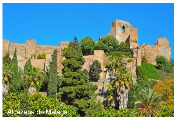
Alcazaba de Malaga

Dinner this evening will be at "El Pimpi", a very popular old wine cellar.