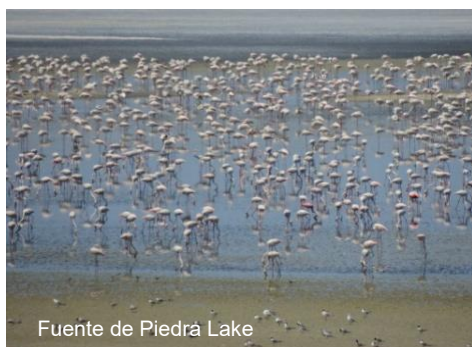
Fuente de Piedra Lake

Located in the Antequera plains, to the north of Malaga province, about one hour's drive from the hotel, this lake can host more than 20,000 pairs of Greater Flamingoes on occasions when winter and early spring rainfall has been generous.