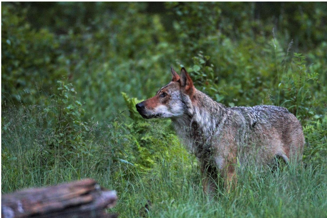
Wolf (all photos in the itinerary taken on the tour)

Join the Naturetrek e-mailing list and be the first to hear about new tours, additional departures and new dates, tour reports and special offers. Visit www.naturetrek.co.uk to sign up.