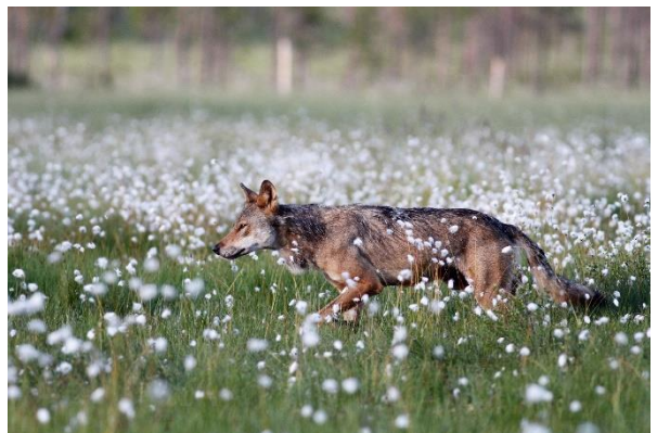
Wolverine, Brown Bear and Wolf