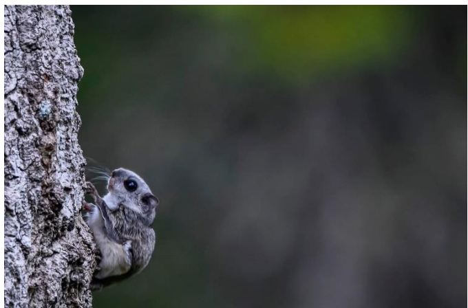
Siberian Flying Squirrel

After a longer night's sleep and an extensive breakfast, we transfer to the small village of Lapua near the west coast. During this scenic 4-hour drive, we will stop regularly for birding and any wildlife we may come across. There are many lakes and forests on the journey, home to various Scandinavian species we will only know from winter months or on migration here in the UK. Common Crane, Common Goldeneye, Osprey, Black-throated Diver,