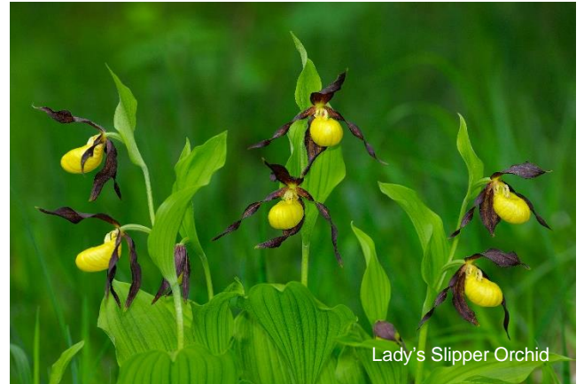
Lady's Slipper Orchid