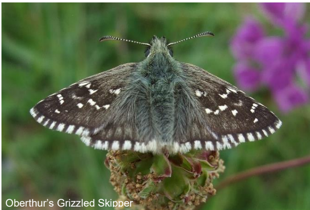
Oberthur's Grizzled Skipper

Today we will explore just south of Cocurès, ascending through St Laurent-de-Trèves, where there are dinosaur footprints in the limestone dating back some 180 million years. This limestone country holds many orchids, such as Bug, Burnt-tip, Early Spider, Early Purple, Lady, Tongue, Woodcock, and Greater and Lesser Butterfly Orchid. Butterflies that we are likely to come across include Wall Brown, Grizzled Skipper, Oberthur's Grizzled Skipper, Heath Fritillary and maybe a Duke of Burgundy amongst others. We then continue up to the Col des Faisses,