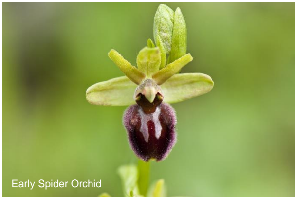
Early Spider Orchid

To the north is Mont Lozère, at 1,699 metres the highest peak in the region. We will make a couple of stops this morning, the first not too far from the hotel, where we walk along a track admiring the fritillaries (Spotted and Pearl-bordered amongst others), blues and whites, and maybe a late Green Hairstreak. We will then visit the small picturesque town of Le Pont de Montvert, where Grey and White Wagtails and Dipper are found in the river.