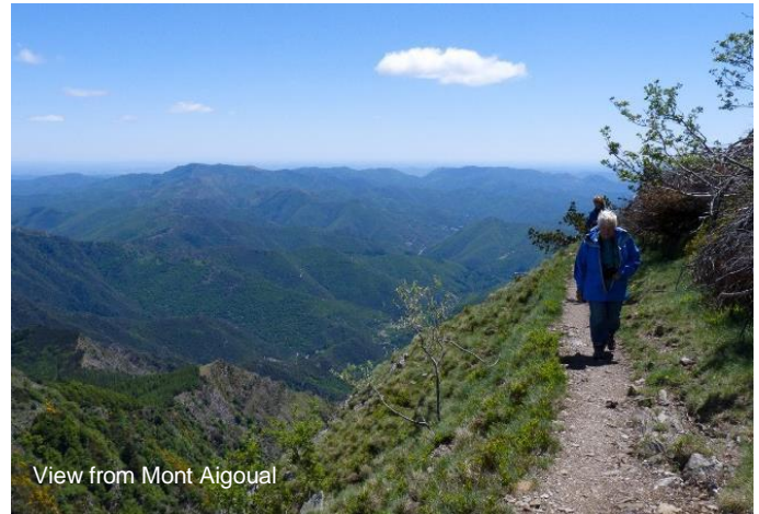
View from Mont Aigoual

The Cévennes is a mountainous region on the south-eastern edge of the Massif Central in France, with a wide variety of scenery and habitats. In the centre is the Cévennes National Park with its surrounding Zone Peripherique giving protection to the wildlife and scenery. Throughout the holiday we will be based in Cocurès in the Tarn Valley, the administrative centre of the Cévennes National Park, a convenient base for exploring the many places of interest to seek out the varied plants, birds, butterflies and other wildlife of the region. We hope to find Aymonin's and Aveyron Orchid, both of which are endemic to the Central Massif, as well as Lady's Slipper, as well as the highly localized Esper's Marbled White.