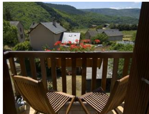
Our hotel in the Cevennes