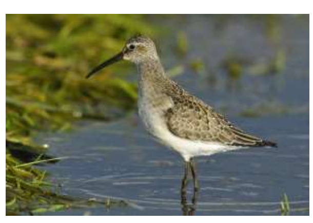
From the top: Knot flock, Yellow-browed Warbler & Curlew Sandpiper