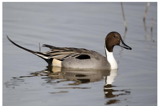
Starlings, Eurasian Kingfisher, Pintail