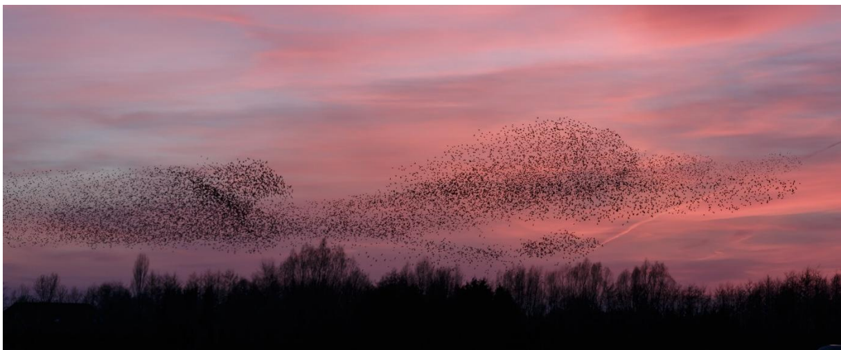
The incredible murmuration of the Common Starling

As well as the success with the Bitterns, the superb habitat that makes up the Somerset Levels has attracted another exciting bird. In 2012 the Great White Egret bred for the first time ever in the UK choosing a location in the levels to do so. It successfully raised a single chick and was successful again in 2013 and the breeding success has since been going from strength to strength. In 2023, 88 chicks fledged in the region. These elegant birds can now be regularly seen on both our winter and summer tours. Another bird we'll be hoping to see is the Starling – or, to be more precise, hundreds of thousands of them! Bill Oddie's now well-known footage of vast flocks put the levels firmly on the must-see British 'birdwatching map' with unforgettable images of vast flocks of Starlings at dusk, swirling and diving before flying to their evening roosts. The Somerset Levels