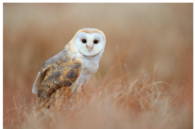
Bittern, Hobby, Barn Owl