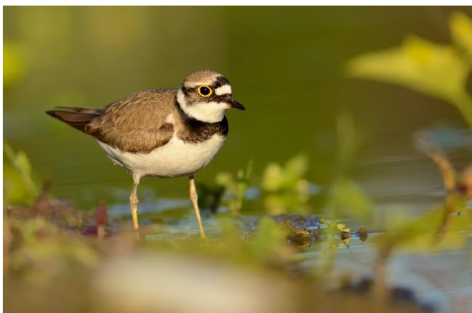
Little Ringed Plover

Willow trees and the now converted flooded peat-diggings are characteristic of the landscape here, and the resulting wetland pools and reedbeds provide superb habitat for wildfowl, waders, and herons. There are tracks running alongside many of these habitats, and there should be plenty of bird activity as we stop at a scrape, viewing point or a lakeside hide. Indeed, spring is an excellent time for birdlife on the Somerset Levels, and our visit in late May is timed to coincide with the breeding season and peak migration. The number and variety of passage waders depends on water