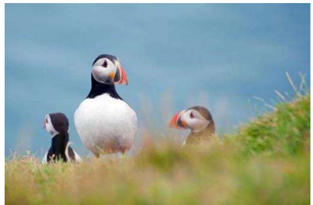
From top: Bempton Cliffs, Atlantic Puffins