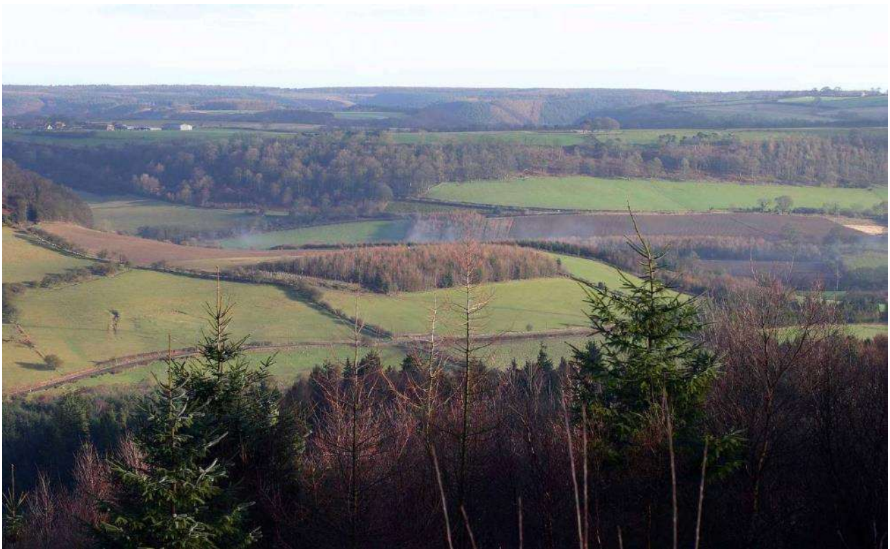
North York Moors National Park

Join the Naturetrek e-mailing list and be the first to hear about new tours, additional departures and new dates, tour reports and special offers. Visit www.naturetrek.co.uk to sign up.