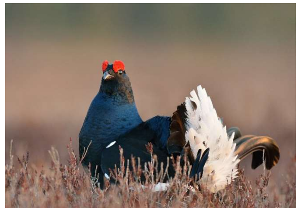
Images from top: Peregrine Falcon, Hadrian's Wall, Black Grouse