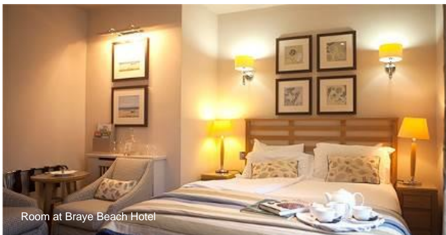
Room at Braye Beach Hotel

We use the 4-star Braye Beach Hotel, by far the best hotel on Alderney. Recently renovated, and decorated and furnished to the highest of modern standards, the hotel overlooks the long white sandy beach of Braye Bay and the colourful Braye Harbour. Half of the hotel's rooms overlook the bay and greet the rising sun; the others overlook a quiet street at the back of the hotel. All rooms are en-suite and equipped to a high spec, but the bay-view rooms are particularly recommended (though they come at a supplement of £30pp for the 4-night stay). The restaurant, bar and terrace of the hotel all overlook Braye Bay.