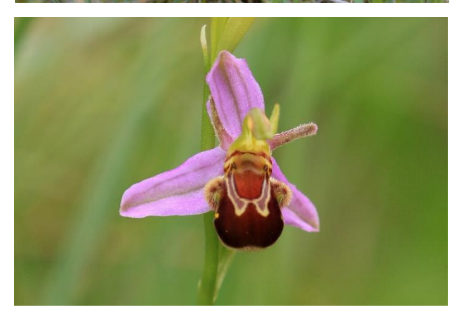
From top: Lundy Island, Dark Green Fritillary & Bee Orchid.