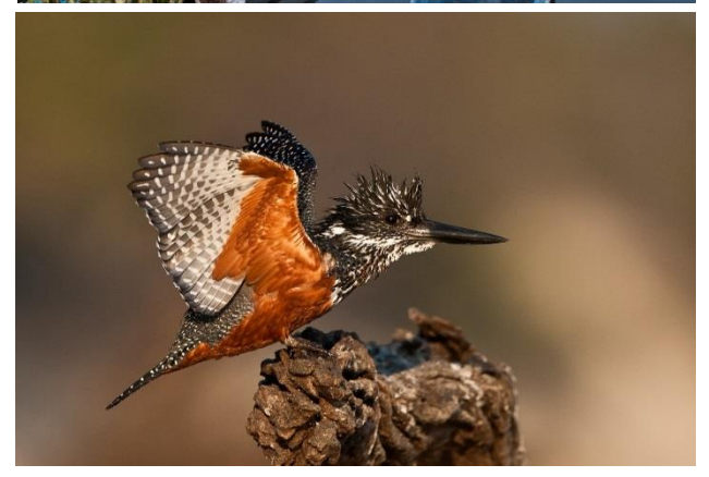
Images from top: Beautiful Sunbird, Floating Lodges, Giant Kingfisher