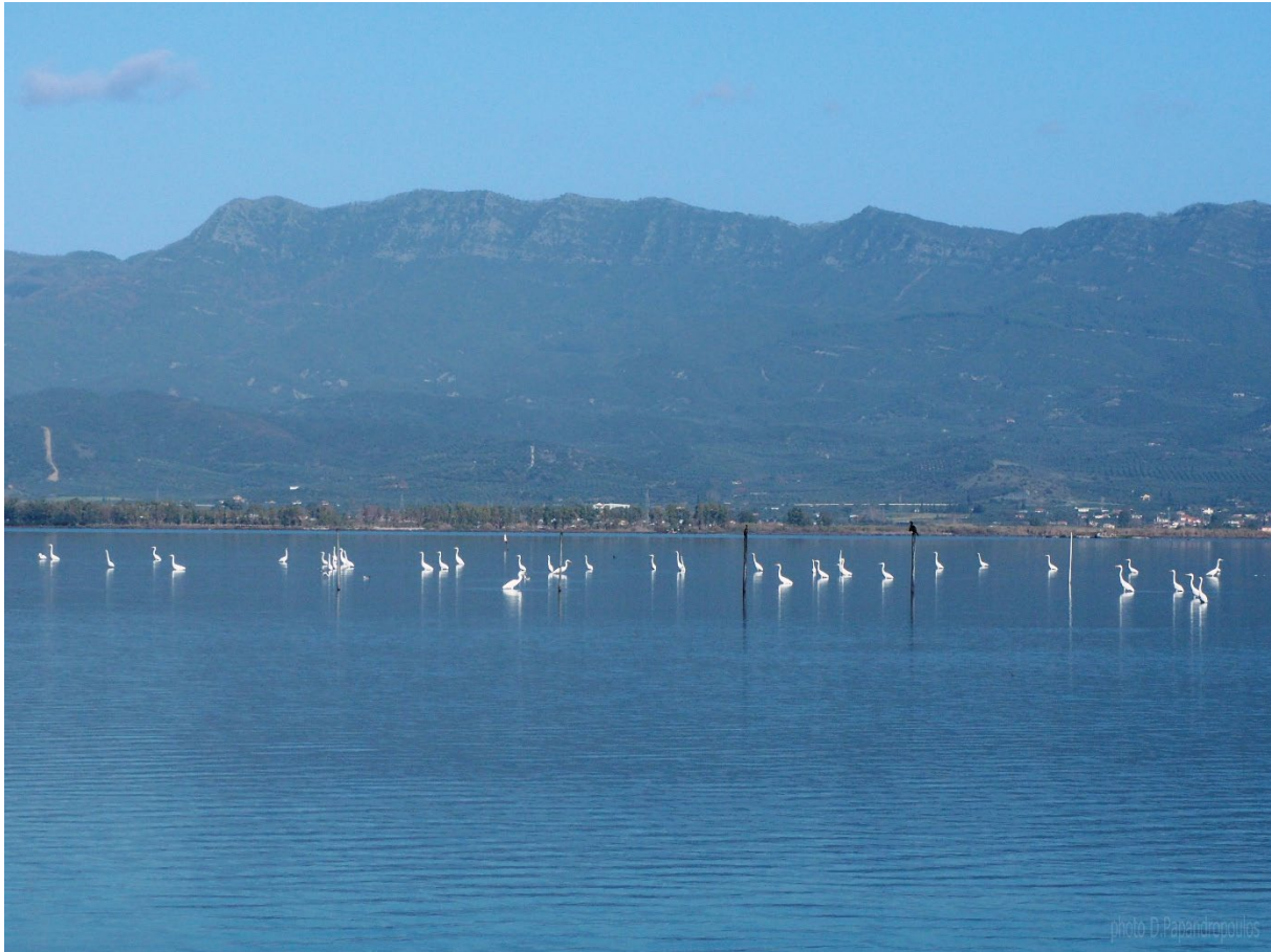
Messolonghi National Park (Natural Greece)

Photographs under license by Shutterstock Ltd and Natural Greece