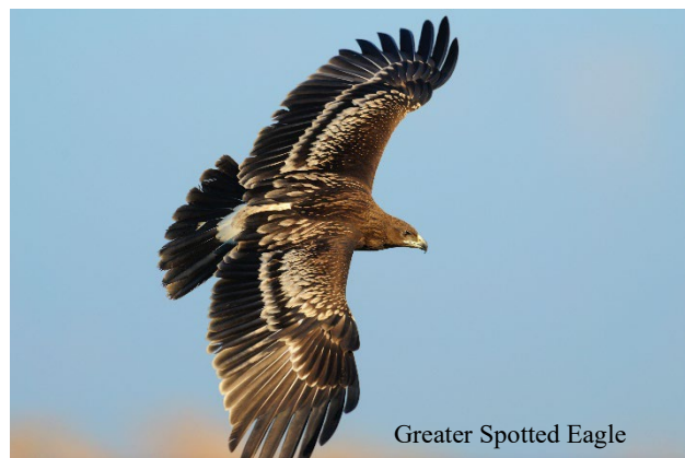
Greater Spotted Eagle

if time permits, we may visit Lakes Lisimachia and Trichonida during our time here, the latter being Greece's largest, natural freshwater lake. Grey Herons and Little Egrets are frequent around the margins, while out on the open water, Great Crested Grebe, Northern Pintail, Northern Shoveler and Eurasian Teal all occur in good numbers and this can be a good area for wintering Ferruginous Duck. Marsh Harriers regularly quarter the reeds and surrounding fields and we may get lucky with a Greater Spotted Eagle.