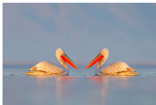
Images: Greater Spotted Eagle, Middle Spotted Woodpecker, Dalmatian Pelican