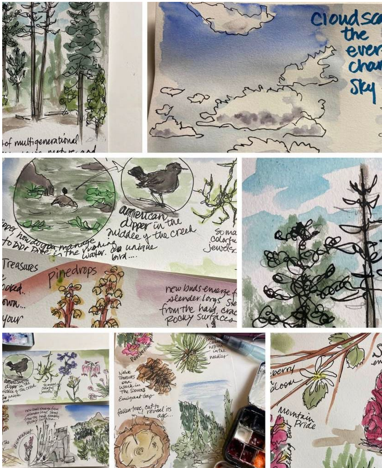
Melinda's sketches from previous nature journaling courses