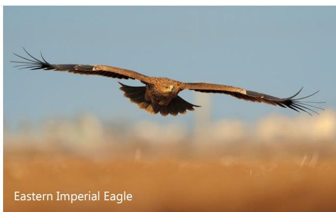
Eastern Imperial Eagle

Hungary is a scenic land of wooded hills and endless flat plains, dotted with reed-fringed lakes and intersected by one of Europe's great rivers, the mighty Danube. With such a variety of landscapes and habitats on offer, it is not surprising to learn that Hungary is also one of Europe's very best wildlife destinations, in particular for its abundant and varied birdlife. Late April to early May is an exciting time in Hungary's avian calendar, as resident species are joined by migrating waders, warblers and raptors on their way north, filling the woods with choruses of birdsong. During this tour we will journey through some of the country's most picturesque 'Magyar' landscapes, from the forested Bükk National Park in the east to the lowland steppe, grassland and farmlands of Kiskunság National Park. Aside from its avifauna, Hungary also has much to offer in terms of butterflies and other wildlife. Not only is it a