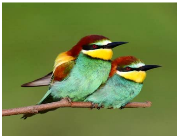
From top: Red-footed Falcon, Great Bustard, European Bee-eater.