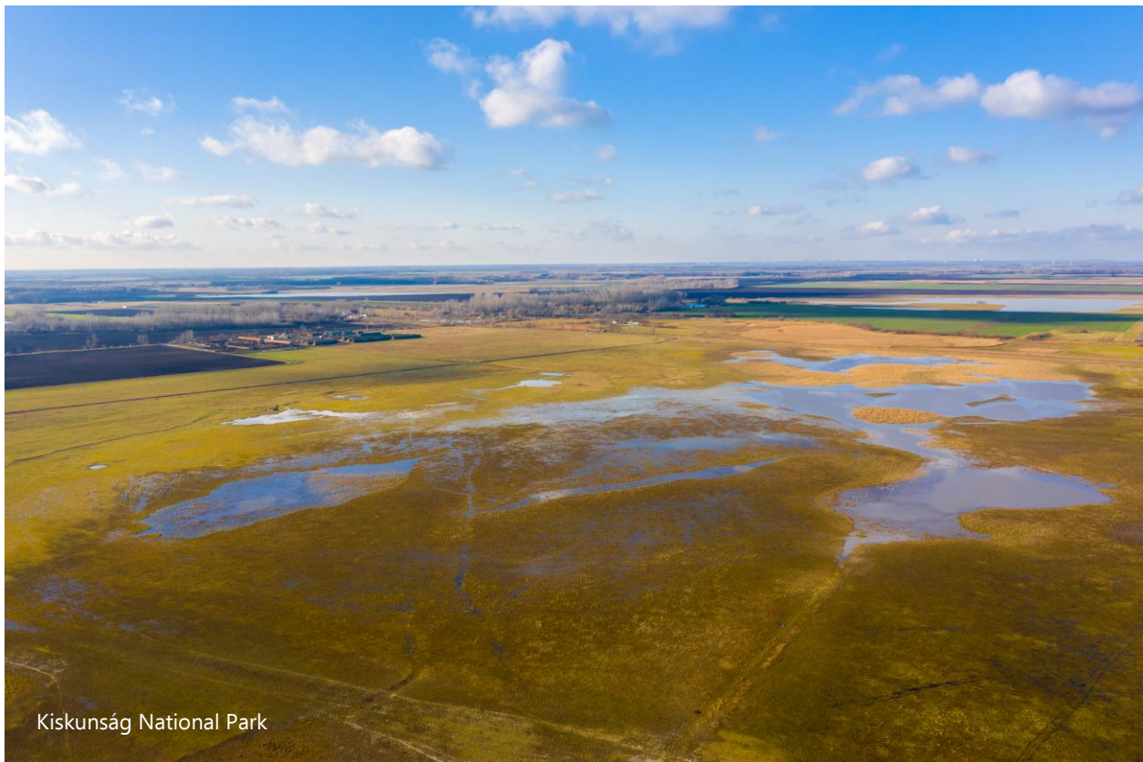
Kiskunság National Park

This is not a photography-focused holiday, but rather a great opportunity to see many of the key Eastern European species that Hungary has to offer, with the likelihood of some great images for those that wish to bring a camera.