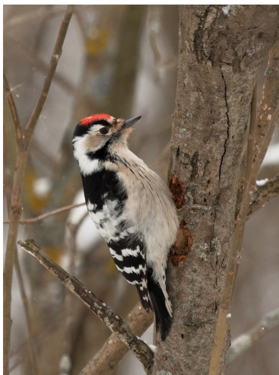
Lesser Spotted Woodpecker

After breakfast this morning, we will leave the open landscapes of the Hortobágy behind us and drive north to reach the Bükk Hills. Situated in the north-east of the country, 97% of the park is covered in ancient woodland, while the limestone karst that forms the hills holds over 900 caves.