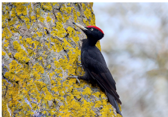
Long-eared Owl, Eastern Imperial Eagle & Black Woodpecker