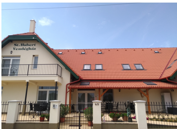
St Hubert Guesthouse

This is a two-centre holiday, firstly staying at St. Hubert Guesthouse in Hortobágy village itself for three nights and then two nights at the Nomad Hotel in the town of Noszavj. Both have all the modern amenities of a typical guesthouse/hotel.