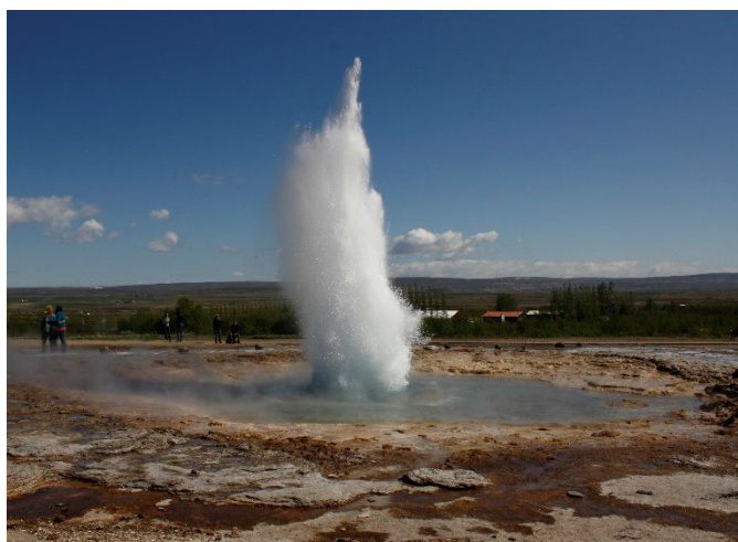
Strokkur erupting (K Porteous)

We will spend much of today visiting some of the most celebrated landscapes in southern Iceland. From thunderous waterfalls to a geological phenomenon that gave its name to the word, Geyser, before returning to the tranquil countryside of Thingvellir. After visiting the 'Althing' - parliamentary meeting place - we will take a stroll by Thingvallavatn, where pure glacial waters from the Langjökull Glacier travel some 40 kilometres, through bedrock, before emerging here to form Iceland's largest freshwater lake. The mournful calls of Great Northern Divers are usually heard echoing across the silvery water, whilst nearby we will go in search of Barrow's Goldeneye on the River Sog. This is also a great place to see young Gyr Falcons and Merlins dispersed from their natal breeding grounds. We return to Hotel Gulfoss for a second night.