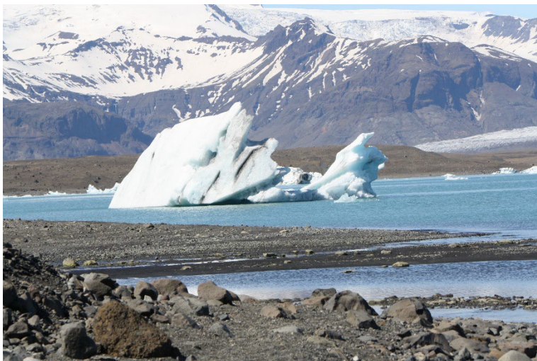
Jokulsarlon Iceberg Lagoon

One of the most majestic spectacles in southeast Iceland, and location of several 'James Bond' epics, is the ice-lagoon on the edge of the Breiðamerkurjökull and our destination this morning. We will take an amphibian-craft for a ride amongst these impressive 1,500 year old colourful ice-sculptures. After which, we will follow the icebergs as they drift to their eternal destiny and search for Snow Buntings and a late Arctic Tern or two. Where the Atlantic rollers pound the black lava sands, at the mouth of Jokulsarlon, we will look for Common Seals that are often found hauled out resting on the beach, and we will also search for any Arctic waders that may be lingering.