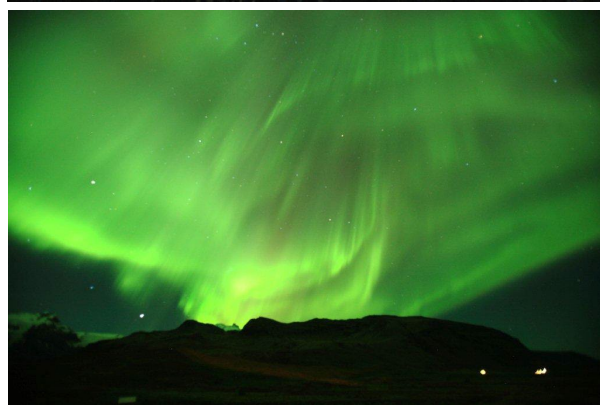
From top: Jokulsarlon Iceberg Lagoon, Skaftafell National Park, Northern Lights