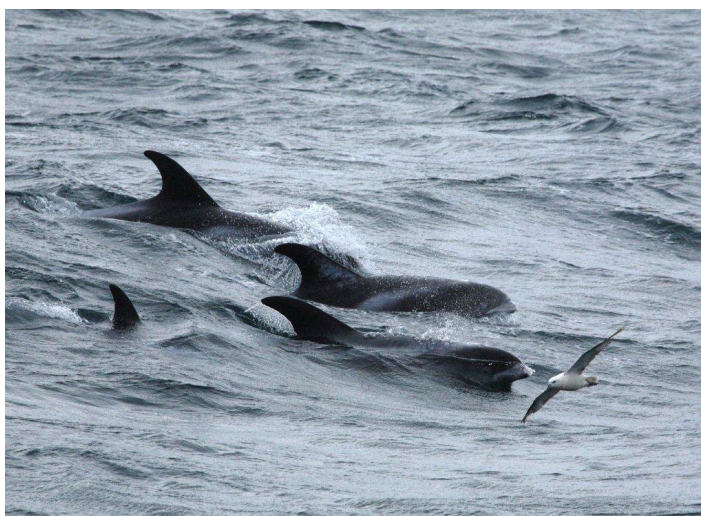
White-beaked Dolphins & Fulmar

Today we will visit the vibrant capital and do a little birdwatching on Tjörnin, the lake in the centre of the city, before taking a whale-watching cruise out of Reykjavik's old harbour, through the scenic Faxaflói Bay, where we will be looking for some of the most amazing marine mammals that inhabit Iceland's rich coastal waters. Minke Whale and White-beaked Dolphin are the most likely species to observe, but with a little good fortune we may find a playful Humpback Whale or a patrolling pod of Orcas.