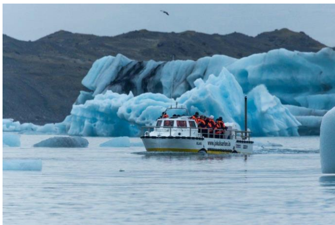
Jokulsarlon (M Stott)

beauty and scale of these icebergs, we will take a cruise amongst them, no doubt accompanied by noisy mobs of Arctic Terns! Here, the Atlantic rollers pound the black lava sands, and at the mouth of Jokulsarlon, we are likely to spot Common Seals and some Arctic waders. On our return to the hotel we plan to make several detours to get close to some of the glacier snouts, as this area holds half of the North Atlantic population of breeding Great Skua.