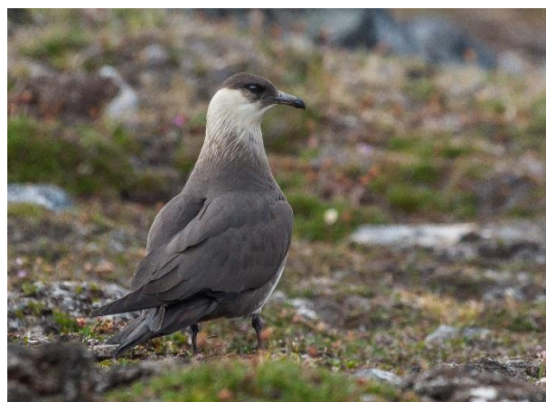
Left: Minke Whale. Right: Arctic Skua