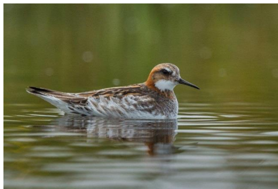
Red-necked Phalarope (M Stott)

Today, we continue our drive east, and as we progress along the southern leg of Iceland's main road, our fellow road users will quickly become fewer and farther between. The journey to our next stop, Djupivogur, is around three hours' drive, but again we will break the journey at scenic spots along the way. Djupivogur is an attractive fishing community, and behind the town is an area of wetlands and marsh, rich in birdlife. We'll stop here for one night, and during our short stay we will look for the likes of Slavonian Grebe and Red-throated Diver. It is usually possible to enjoy fantastic views of Red-necked Phalarope here, providing us with some great photographic opportunities. With the lengthening days there will be plenty of daylight late into the evening, and we will make the most of it by enjoying a post-dinner stroll around the harbour.