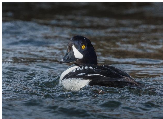
Barrow's Goldeneye (M Stott)

eruptions permitting!) we will take a short diversion before reaching Mývatn to enjoy Dettifoss, Europe's largest waterfall, and the Jökulsá Canyon (Iceland's Grand Canyon). Here, the sheer volume of water thundering over