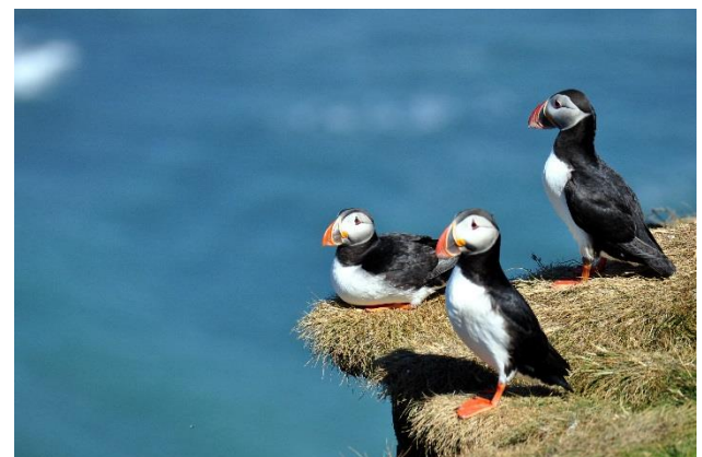
From top: Jokulsarlon Iceberg Lagoon, Great Skua, Atlantic Puffins.