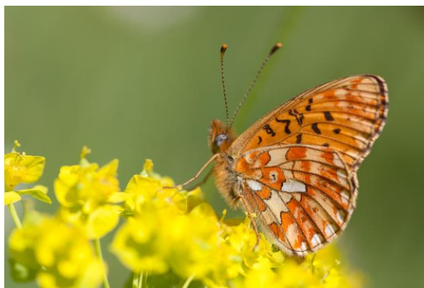
Pearl-bordered Fritillary by Ron Brown

Today we will explore the Vallone Pesco di Lordo, which rises gently through meadows and well-established beechwoods ( Fagus sylvatica ), from near the hotel. The older beech trees here provide a good habitat for the range of woodpeckers found in the area including, possibly, the very rare Lilford's White-backed Woodpecker. We will enjoy the range of butterflies, while plants may include such woodland species as Coralroot ( Cardamine bulbifera ) and Herb Paris ( Paris quadrifolia ). The main botanical focus will be, however, to search for the endemic Marsican Iris ( Iris marsica ).