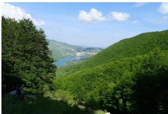
Valle di Rose by Lee Morgan

We start in the medieval hilltop village of Civitella Alfedena, above the Lago di Barrea. The stony path goes steeply upwards through forest and clearings. Under the Beech trees ( Fagus sylvatica ) we will look for Sword-leaved and White Helleborines ( Cephalanthera longifolia and C. damasonium ), Bird's-nest Orchids ( Neottia nidus-avis ) and the delicate Coralroot Orchids ( Corallorhiza trifida ). Wood Warblers and Western Bonelli's Warblers are often heard here, and we will watch out for Wolf droppings by the path.