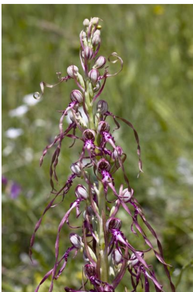
Adriatic Lizard Orchid

We will have our picnic in a meadow nearby, before taking the opportunity to sample the wares of the town's gelateria. We will return to the hotel to give people the opportunity to rest or pack, before another local walk. After dinner, we will have a final chance to go out, or we may spend the evening relaxing by the fire!