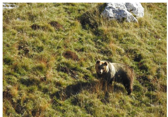
Abruzzo Chamois, Lady Slipper Orchid, and Marsican Brown Bear.