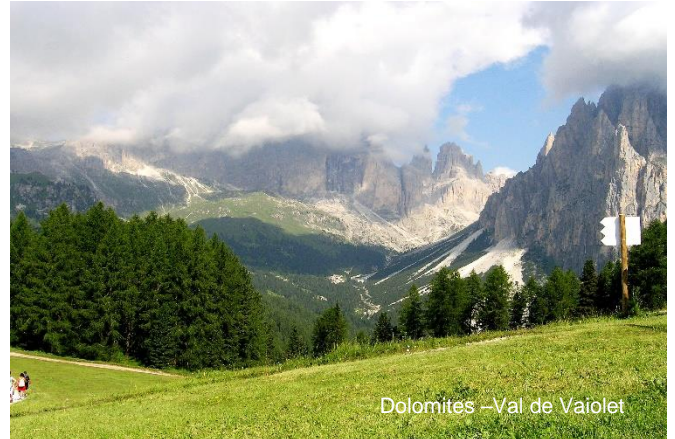
Dolomites –Val de Variolet