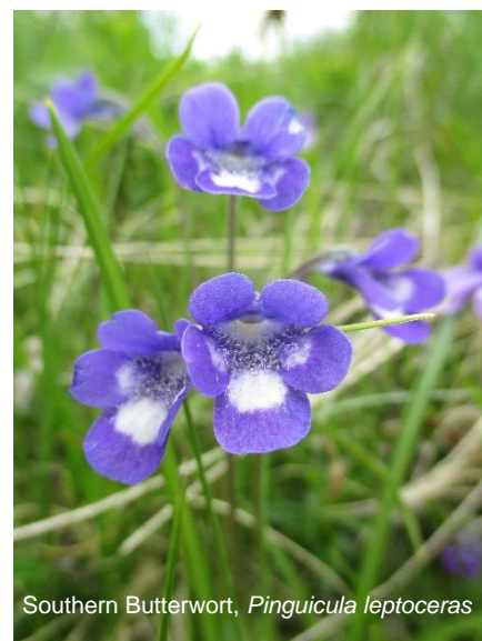
Southern Butterwort, Pinguicula leptoceras

After a picnic lunch by the river we climb through rocky spruce woods, seeing Primula auricula , and several spp. of Gentian and Saxifrage on the way. We come out on the almost white limestone scree of that magnificent mountain Cimon della Pala, where we will see our first pink patches of Rhodothamnus chamaecistus , the Dwarf Alpenrose and the endemic Primula tyrolensis .